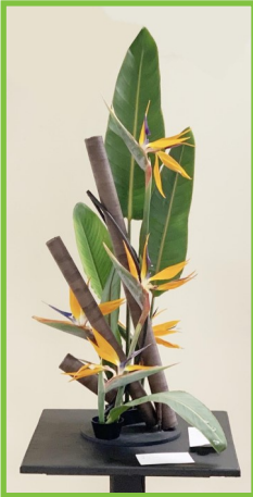
Class 3 “We hoarded toilet paper” winner Lori Richie