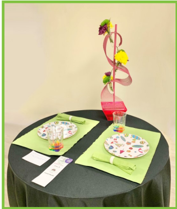
Class 4 “We lunched on the Lanai” winner Crystal Herold